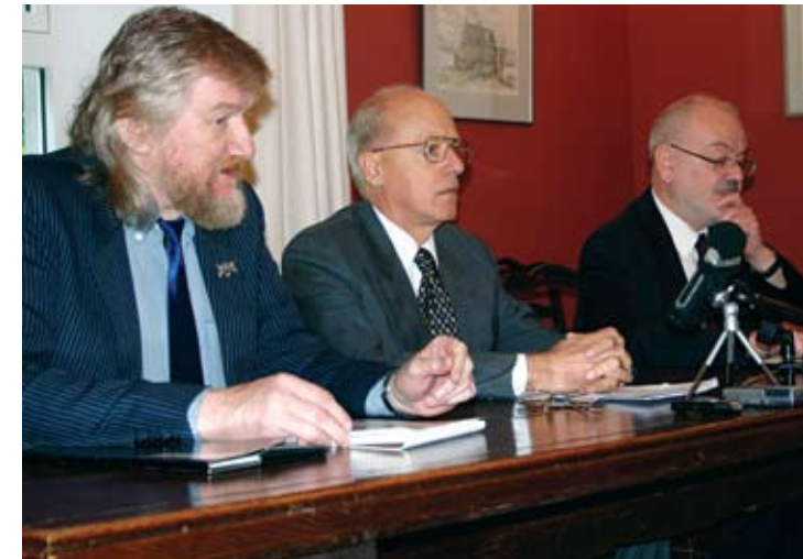
Seeking a way forward.

"Scottish justice may still come out very well, if there is a new appeal, which is fair, and conducted with all the material and all the evidence made available to both sides, then there is still a chance. If not, this will just be one of the many cases where politics finally prevailed over law. This is the result of a political and international constellation that Scotland cannot control. But still, the judiciary should try to act independently and not give in to the political pressures."